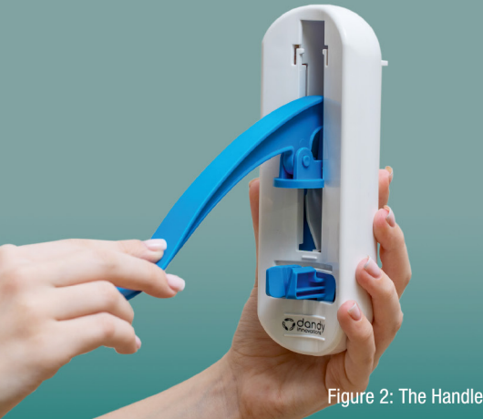
Figure 2: The Handle