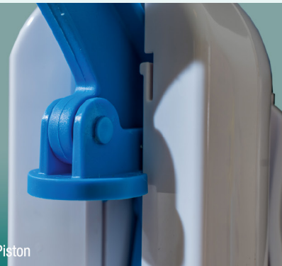
Figure 3: The Piston

The piston provides a downward movement and is used as the “press” for the syringe’s piston, the filter, or the test tube.