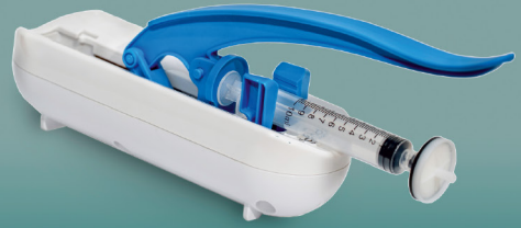
Figure 1: The “dandyVice”

The “dandyVice” is a tool that assists in the process of the routine filtration in a laboratory. The concept of the “dandyVice” is aimed at reducing the pain you feel in your hand and when you deal with samples having high concentrations of solids, viscose samples, or samples with high molecular weight.