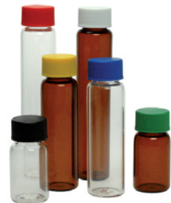
Vial ø 19 mm Volumes: 5 - 15 ml