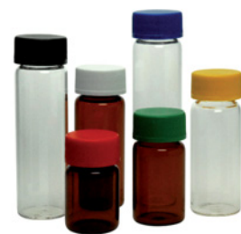
Vial ø 23 mm Volumes: 7.5 - 25 ml