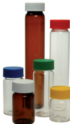
Vial ø 27 mm Volumes: 10 - 60 ml