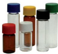
Vial ø 14 mm Volumes: 1 - 5 ml