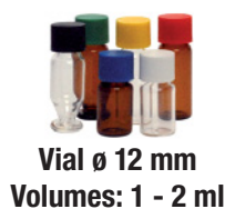
Vial ø 12 mm Volumes: 1 - 2 ml