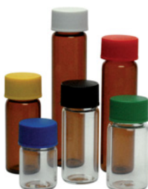
Vial ø 17 mm Volumes: 2.5 - 10 ml