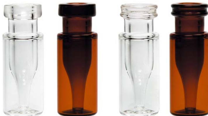
iV2 \mu Snap/Crimp Vial